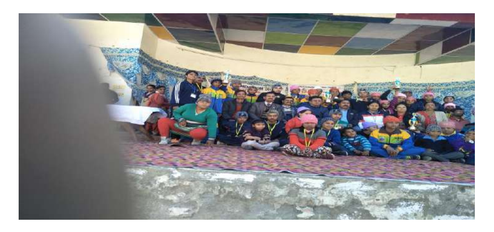
Prize distribution function in district level games given by ADM solan