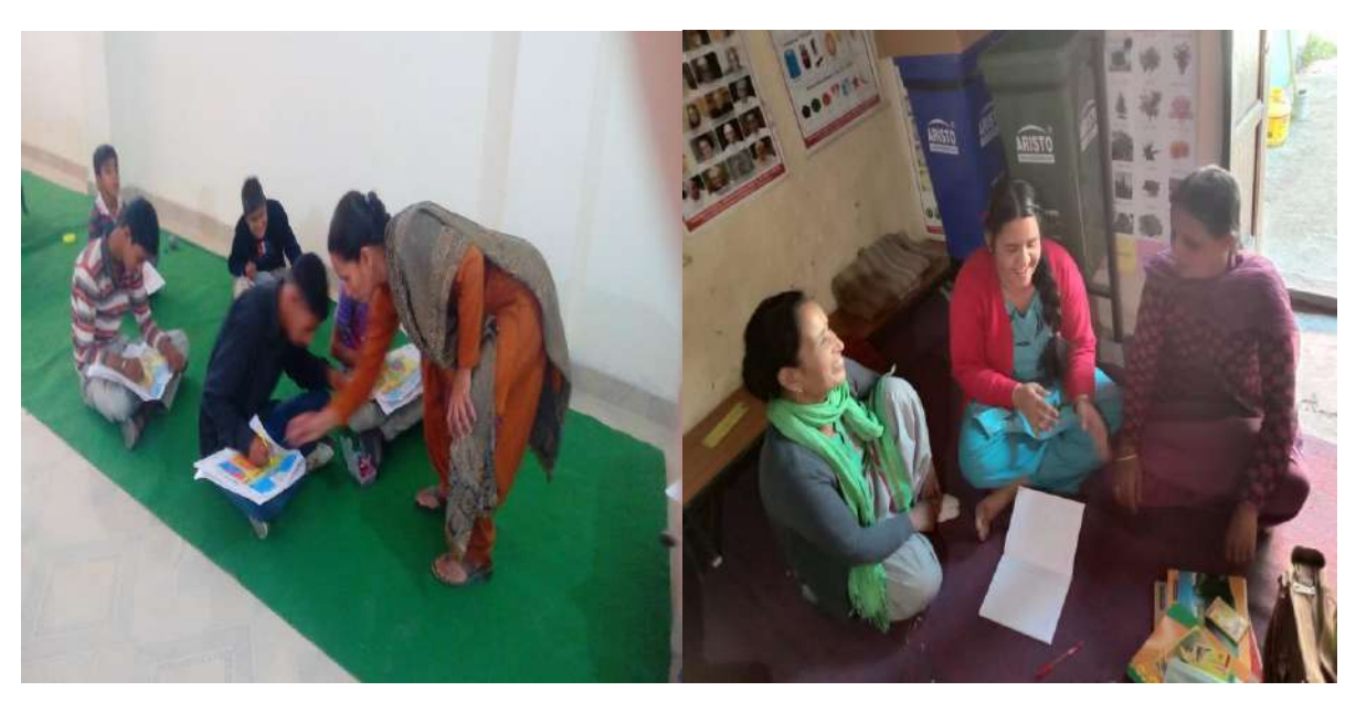
Day care activities in our Disha cum Vikas centre

further; rays of hope again realized when national trust lunch new schemes in 2015 . In this program those CWSN's who belong to nearby villages and can come to the educational center along with their parents. It becomes more convenient to pay individual attention along with some kind of group activity. Our special educators are prompted to prepare their own teaching learning material. Sizes of the models are kept big for easy discrimination; readymade models are purchased for difficult models. Other writing material is given to the children for home exercises. Ten children (age group 0 – 10 years) along with their parents gather at our day care and perform the following activities.