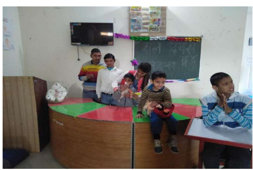
group of children