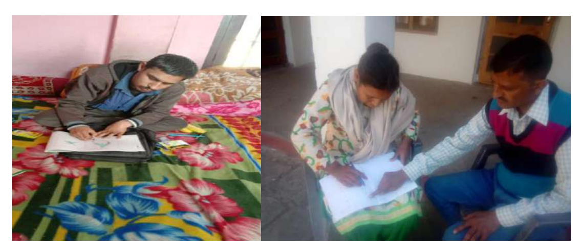
home based activities of children

Academics Skills are taught to the extent that the child can read/write counting, alphabets, his/her name, recognize the colors, currency notes identification and very minor addition and subtraction. Now because these skills do not come naturally to the child, so some of the skills are to be repeated on a daily basis. Name and addresses of the child concerned are taught to perfection.