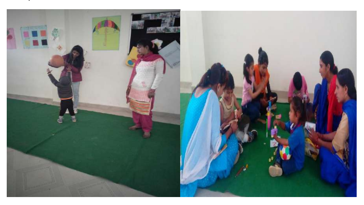
Day care activities in our Disha cum vikas centre

Main objective of this program is to train children above ten years of age in vocational and skill attainment for their livelihood, employment, adjustment in society and to fulfill their therapeutic need.